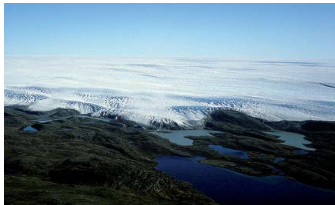
The Greenland Ice Sheet 65 km north of Kangerlussuaq, W. Greenland.

The Greenland Ice Sheet is the Northern Hemisphere's largest terrestrial permanent ice- and snow-covered area and represents a reservoir of water, containing between 7.0 and 7.4 m global sea level equivalent. This ice sheet is a useful indicator of ongoing climatic variations and changes, and it is suggested that the ice sheet responds more quickly to climate perturbations than previously thought. It is therefore essential to predict and assess the impact of future climate on the ice sheet. Variability in mass balance of the Greenland Ice Sheet closely follows climate fluctuations; the mass balance was close to equilibrium during the relatively cold 1970s and 1980s, and lost mass rapidly as climate warmed in the 1990s and 2000s with no indication of deceleration. A response to the altered climate has already been observed, manifested by